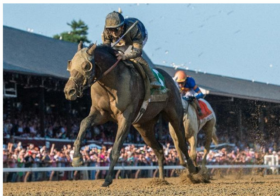
Sierra Leone (top) and Delacroix (bottom) each score 9/9 on our Sire Prediction Points scale