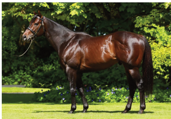
No Nay Never, sire of 4 Royal Ascot winners

So, seven races a day, first race 2.30pm, last race 6.10pm, 35 races in all. There are eight G1 races, eight G2's, three G3's, three Listed, 12 Handicaps (all worth £110,000+), and one Conditions race, the final race on the final day, the 2 ¾-mile Queen Alexandra S. And what did we learn – who were the big winners?