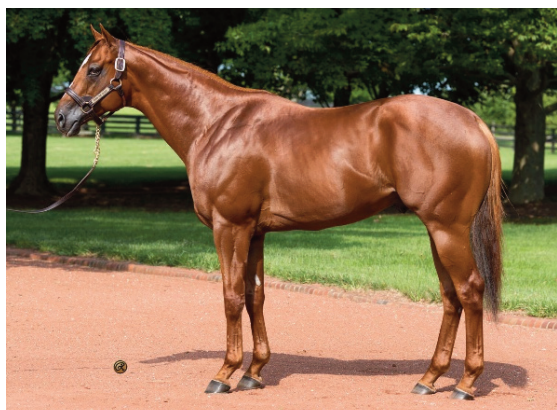
Drain the Clock, leading sire by number of yearlings (15) catalogued at FT July.