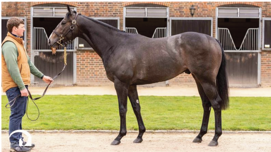
Top priced European 2yo in Training for 2025 Lot 143 Celestial King (Havana Grey x Show Stealer (Showcasing)) Consigned by Malcolm Bastard, sold to Amo Racing for 1,750,000gns