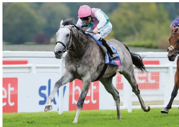
Field of Gold, winner 8f St James's Palace Stakes (Kingman x Princesse de Lune (Shamardal))

Love in the Queen Mary) and he also sired two Handicap winners for four winners total to top that sire list); and the G2 Coventry with Gstaad, by Starspangledbanner. They also won the G2 Ribblesdale (3f,12f) and the G3 Hampton Court (3yo's,10f) with the filly Garden of Eden (by Saxon Warrior) and the colt Trinity College (by Dubawi out of Hermosa) respectively. Godolphin won four races, including the G1 Prince of Wales's (10f) and the G1 Ascot Gold Cup (2 ½ miles) for 4yo's+, with Ombudsman (by sire-of-the-moment Night of Thunder) and Trawlerman (by Golden Horn) respectively.