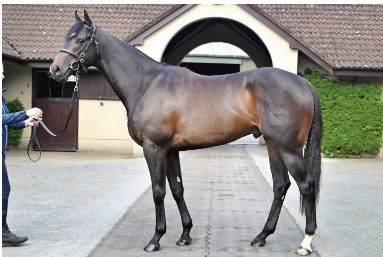
Arqana Breeze Up Sale top, lot 110 Justify x Inchargeofme (High Chaparral) Consigned by Oak Tree Farm, sold for €2,300,000 to Godolphin