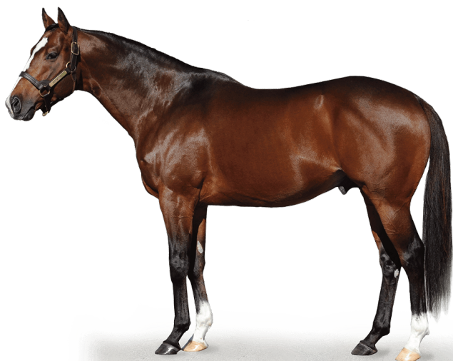
Into Mischief, leading sire of 2022 ABC Runners.