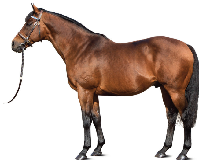
Dubawi, leading Sire of A Runners in 2022.