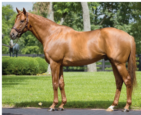
Gun Runner, leading F2019 sire of 2022 ABC Runner.

APEX stallion ratings cover a seven-year period or, in the case of Mid-year or Mid-Season statistics, 6 ½ years; the current Mid-year APEX run covers racing in North America, the U.K., Ireland, France, Germany, and Japan from January 1, 2016 – July 10, 2022. But we also want to know who's doing well now, so these tables tally sires' A Runners and ABC Runners for 2022 only. The caveat here is that Mid-year calculations are done on racing only through that point of the year; if you look at the Earnings Thresholds table which shows the threshold earnings figures (in US$) for each jurisdiction covered, you'll see that the earnings at this point of the season are some way below the year-end figures (with the exception of 2020). For example, in 2021 in North America 'A Runners' (the top 2% of earners/runners) had to earn $156,910 or more to qualify as an A Runner. But through July 10 the top 2% figure was $112,260, whereas the year-end 2021 B Runner threshold was $111,631. There will therefore be horses counted as A Runners thus far in 2022 who will inevitably end up as B Runners at the end of the season. So these 2022 ABC Runner counts should be regarded as interim; the final figures are sure to be somewhat different. But they won't be that different and this is a good snapshot of where things stand now.