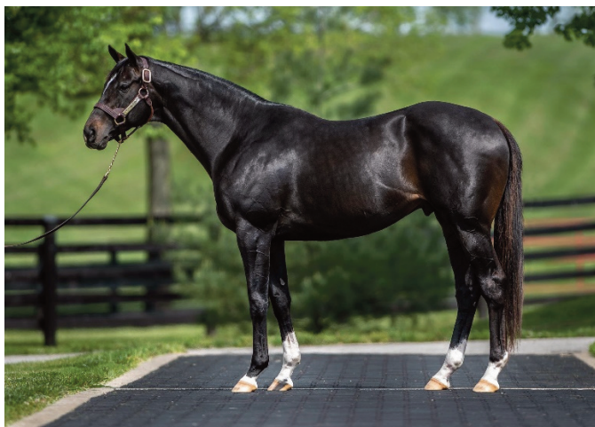
Not This Time, leading F2018 sire of 2022 ABC Runners.