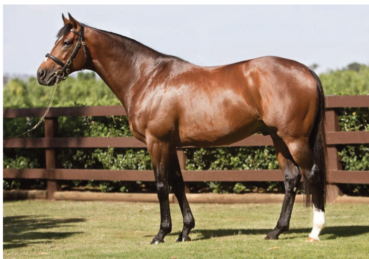
Galileo just keeps going - once again leading sire by APEX A Runner Index.