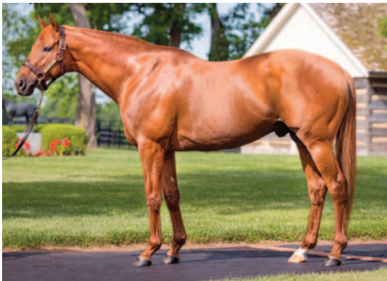
Gun Runner, 4.59 A Runner Index.

Fellow European sires Dubawi (5.49) and Frankel (4.74) rank two-three by A Runner Index among 363 North American and European sires with 195+ year-starters 2016-2022. Sharp-eyed readers may wonder why we are using 195 this year when we usually require 200 year-starters to be eligible for our overall Top 50 lists. The answer is simple: Gun Runner (4.59), who finished his progeny's first 3yo seasons with 196 year-starters. We're a flexible bunch, and it seemed a shame to leave him out because he didn't happen to have another four year-starters by the end of 2022, so – 195 it is, for this year anyway. He comes in at #4 on the charts, relegating the long-reigning former NA #1, War Front (3.74), to #2 in North America and #5 overall. Another 10 NA/EU sires with 195+ year-starters record A Runner Indexes of 3.00+: Europeans Adlerflug (3.73), New Bay (F2018, 1st foals 4yo's of 2022, 3.46), Sea The Stars (3.43), and Farhh (3.02); and Kentucky sires Curlin (3.56), Constitution (F2017, 1st 5yo's 2022, 3.46), Tapit and Medaglia D'Oro (both 1st foals 2006, both 3.23), Uncle Mo (3.13), and F2018 (1st 4yo's) Not This Time (3.09).