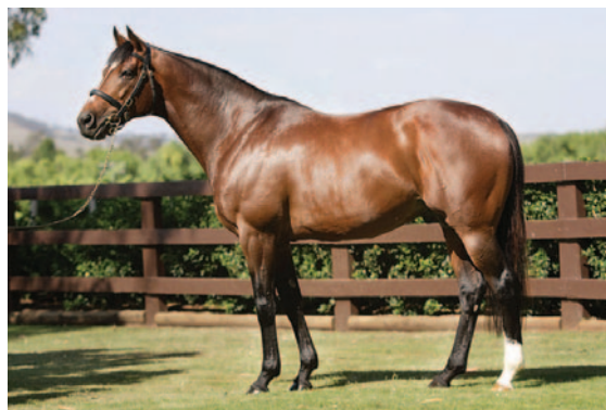
Galileo, 6.16 A Runner Index.

an annual basis, meaning one horse is counted as one runner every year/season it races, up to seven in APEX. So a horse who races in two different years is two Runners, etc., and the same for A, B, and C Runners; Winx, for example counted as six A Runners, because she reached the respective A Runner earnings thresholds in six separate seasons. There are a total of 17 different APEX ratings: A, B, and C Runners in each of three Northern Hemisphere Regions (North America, Europe, Japan), so that's nine indexes; A, B, C, and ABC runners combined in the three regions combined, which is four more indexes; and 'age indexes' for ABC Runners as 2yo's, 3yo's, 4yo's and 5yo's and up. This enables us to chart sires' typical progression at different ages: Sea The Stars, for example, has ABC Age Ratings of: 2yo-0.62; 3yo-1.75; 4yo-1.93; 5yo+ 2.41. So you know when you breed to or buy one by Sea The Stars it is less likely to be a smart 2yo compared to, say, his half-brother Galileo (2yo-2.94).