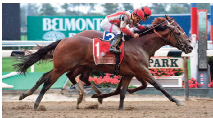
Practical Joke, 10 A / 41 ABC Runners