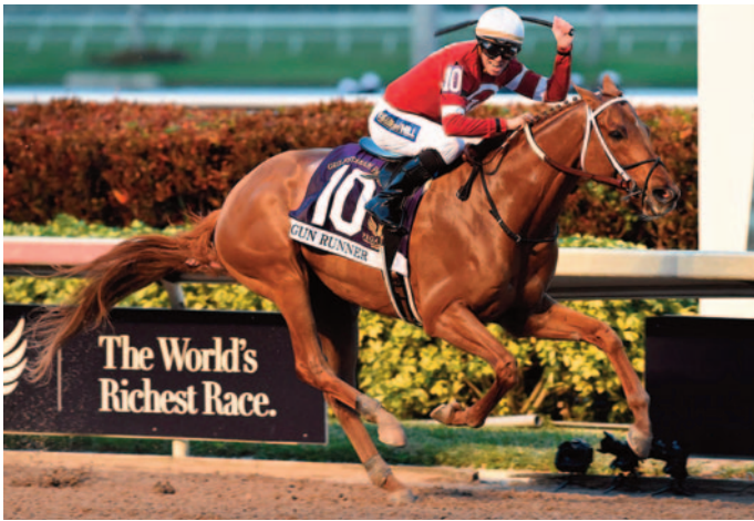
Gun Runner, 4.59 A / 2.55 ABC Index