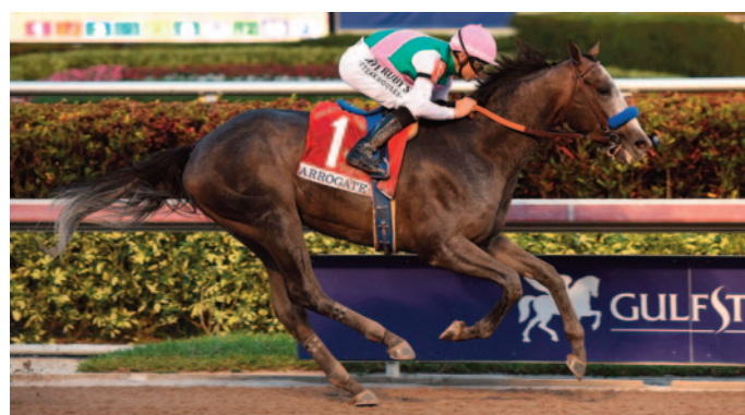
Arrogate, 8 A / 23 ABC Runners