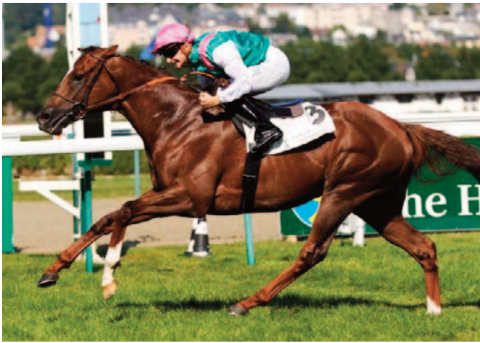
New Bay, 3.46 A / 2.06 ABC Runner Index