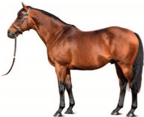
Dubawi, 2.90 ABC Runner Index

'youngest' sires on this list are two 15yo's: F2014 Frankel (118) and F2013 Uncle Mo (109). Galileo (223, avg almost 32/yr) and Dubawi (185, 26/yr) are way out in front by this metric; Into Mischief (135) is a distant third by number of 2016-22 A Runners. Also among the 13: Curlin (116), War Front (93), Ireland's Dark Angel (91) and Sea The Stars (90).