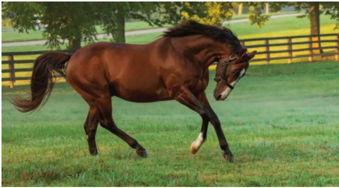
Into Mischief, 73 ABC Runners in 2022