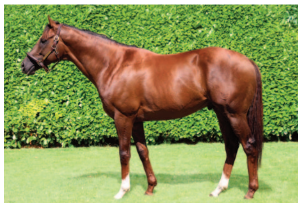
New Bay, 3.46 A Runner Index.

A key method we have always employed in stallion analysis is to divide sires by their age of oldest foals; this enables us to look at a smaller, isolated group of sires who have all, in some ways, had equal opportunities. There are 82 F2018 NA-EU sires assigned APEX ratings who went to stud in 2017 and had their first foals in 2018, and 76 F2019 NA-EU sires who went to stud in 2018 and had their first foals in 2019. F2018 sires had their first 4yo's in 2022, and now have their first 5yo's; F2019 sires had 3yo's of 2022 and now have 4yo's. For these tables we remove the 195+ year-starters stipulation, so all F2018 and F2019 sires who qualify for APEX ratings are included in these tables.