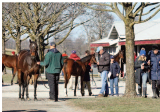
Keeneland January Sale