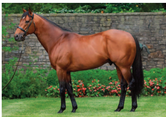
Practical Joke, 41 ABC Runners.

Six F2018 sires had 10+ A Runners (keep in mind one horse can be counted up to three times in the F2018 tables) by the end of 2022. Not This Time (20) edges out Mehmas (19), who led this group with 461 year-starters. New Bay (16), Nyquist (15), Laoban (13), and Kodi Bear (11) also have 10+ A Runners. Not This Time (2.31), New Bay (2.06), and Nyquist (1.95) are the top three by ABC Runner Index. Not This Time (60), Mehmas (59), and Nyquist (54) all have 50+ ABC Runners, well clear of Frosted (39) and New Bay (38).