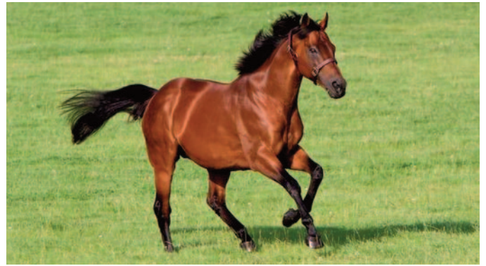
Dubawi, 31 A Runners in 2022