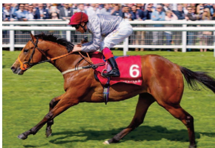
Mehmas, 19 A / 59 ABC Runners