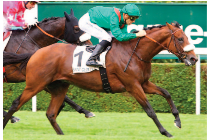
Zarak, 4.33 A / 2.04 ABC Index