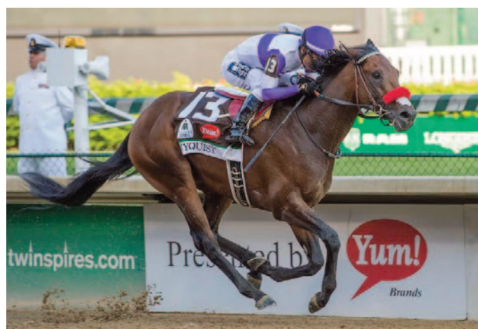
Nyquist, 15 A / 54 ABC Runners