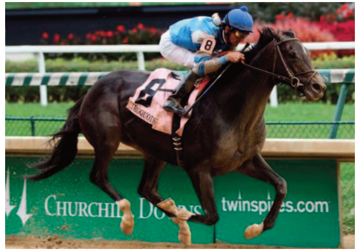
Not This Time, 3.09 A / 2.31 ABC Index