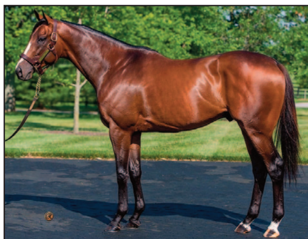
Constitution, 3.39 A Runner Index.

F2017 EU: French sire Galiway , who has just 89 year-starters, is the leading European F2017 sire by both A Runner Index (4.49) and ABC Runner Index (2.53). He is the sire of Sealiway , winner of the G1 Lagardere in 2020 and the G1 British Champion S. in 2021. Night of Thunder (2.61/2.33) is the only European F2017 among the top 26 NA-EU sires with a 2.50+ A Runner Index and 200+ year-starters. Gleneagles (2.06 A Runner Index) and Make Believe (1.90) come next by A Runner Index, with Gleneagles (1.73) #3 by ABC Runner Index. Night of Thunder and Gleneagles (14 each) are tied for the lead by number of A Runners, while Night of Thunder (50) has a slight edge over Gleneagles (47) by number of ABC Runners. Galiway and Make Believe (8 each) are tied for third by number of A Runners; Golden Horn (34) is third by number of ABC Runners.