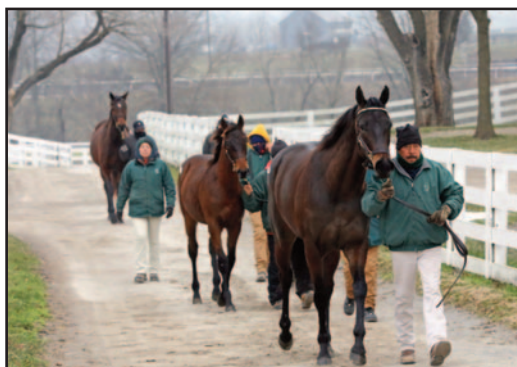
Keeneland January Sale