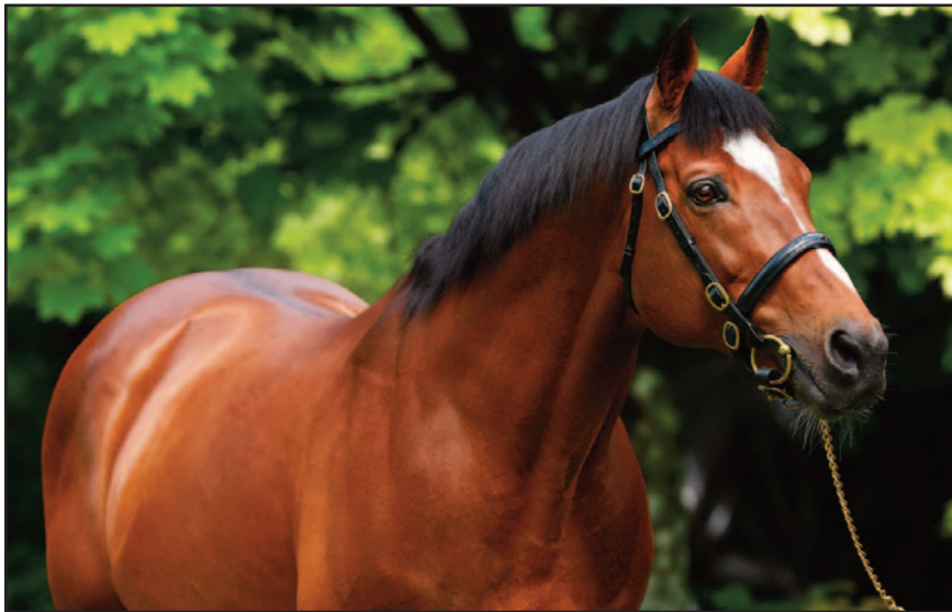
Galileo, leading EU sire by A Runner Index.