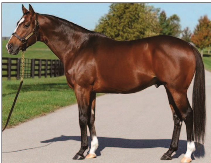
Into Mischief, leading NA sire by number of ABC Runners.