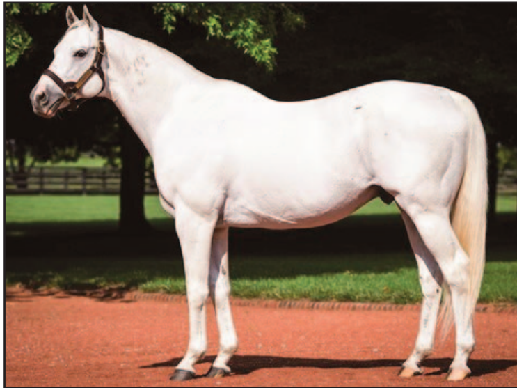
Tapit, leading NA sire by number of A Runners.. Photo courtesy Gainesway