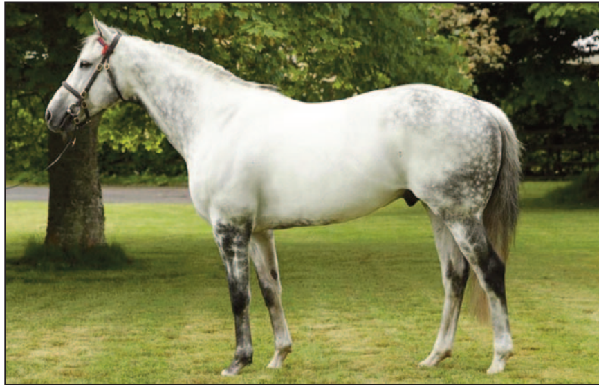
Dark Angel, #3 EU sire by number of ABC Runners.