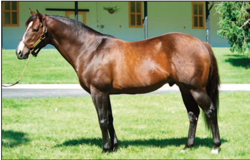
War Front, leading NA sire by A Runner Index.