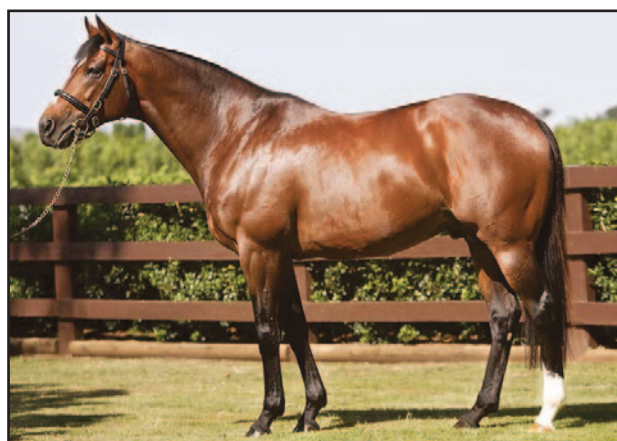
Galileo, 6.26 A Runner Index.

Runner Indexes of 2.50+; 13 had indexes of 3.00+; and three had indexes of 4.00+. Significantly, 13 of the 26 were from North America, 13 were European. Always before we have run the two groups together as one combined list, but as one or two subscribers have pointed out to us, most of the racing and breeding done on each side of the Atlantic stays on that side, so many subscribers are professionally more interested in one side or the other and perhaps only academically interested in the other side. Consequently, in a departure from our previous habits we are publishing Top 25 tables for North America (229) and Europe (137) separately, as well as our traditional Top 50 lists covering all 366 sires.