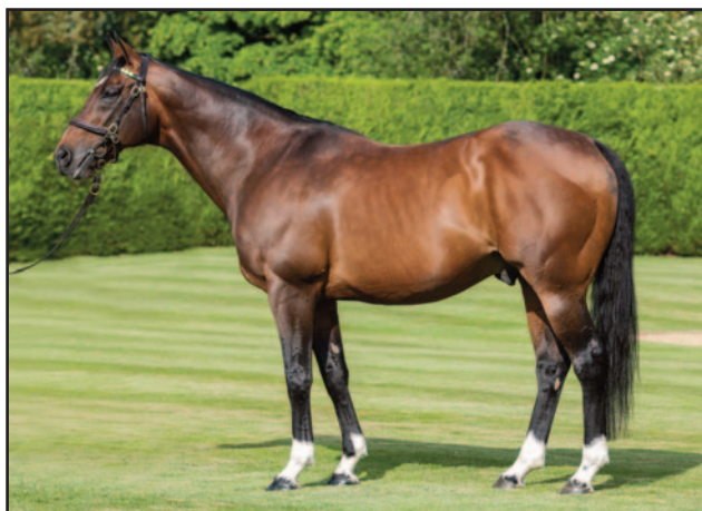
Frankel, 4.79 A Runner Index.