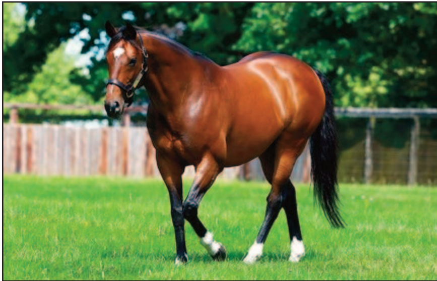
Frankel, #3 EU sire by number of A Runners.