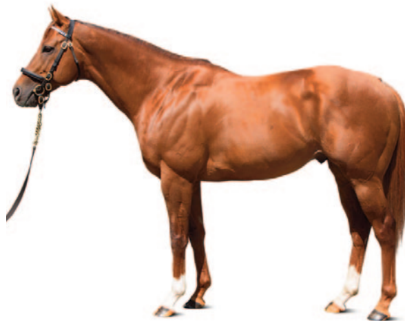
Night of Thunder, 2.61 A Runner Index.

The two youngest sire crops at which we look in more detail each year are those whose first 4yo's (F2017 in this case) and first 3yo's (F2018) have finished racing; on pp. 16-23 we list the top ten on each side of the Atlantic and the top 20 combined in the same four categories: A Runner Index; ABC Runner Index; Number of A Runners; and Number of ABC Runners. We look at these crops in more detail because of course we want to be tracking carefully the youngest sires with available statistics, but also because the minimum number of year-starters for inclusion in the Top 25/Top 50 tables is 200, whereas all F2017 and F2018 sires (many of whom do not yet have 200 year-starters) which qualified for APEX ratings (10+ foals of 2018, 20+ year-starters) are included in the youngest-crops tables.