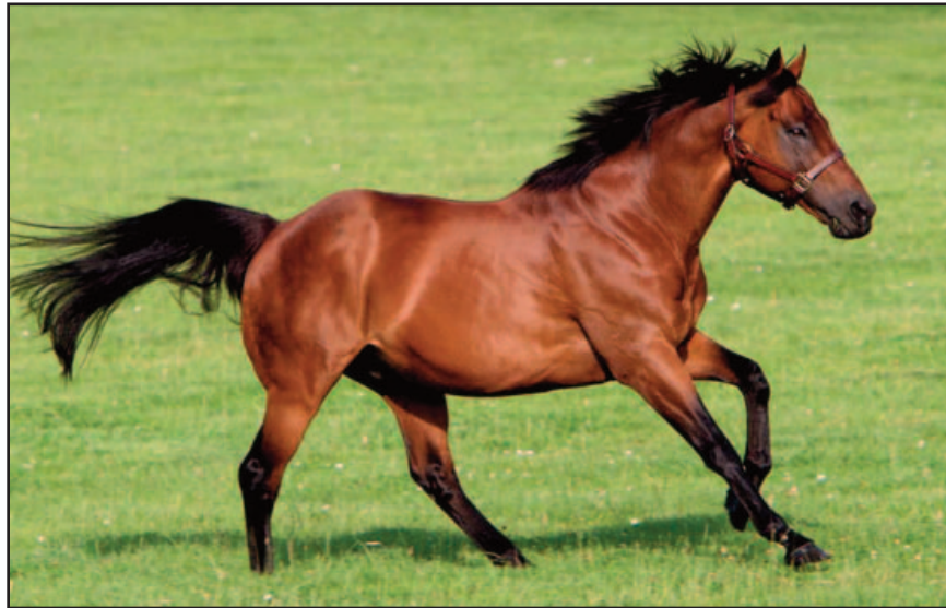
Dubawi, #2 EU sire by ABC Runner Index.