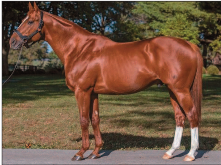
Curlin, #2 NA sire by ABC Runner Index.